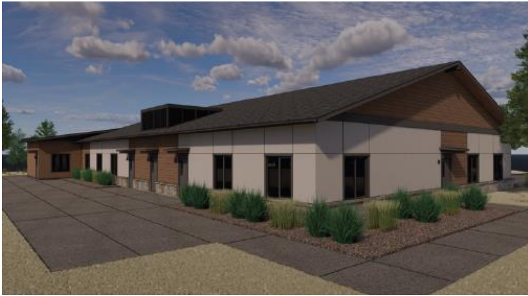
Figure 3b: Proposed Mountain Tots facility façade, north side of structure

Staff Comment: The entrance to the site is from Haymeadow Drive and allows efficient access and wayfinding by emergency services. The proposed development is positioned on the property to avoid steep slopes, natural drainageways, natural hazards, wildlife habitat, utility easements, and defined view corridors. There is no significant grade change on the property and the structure is generally placed at the high point and parallel to topographic lines. Additionally, the building is sited to allow efficient and safe access from the parking area to entry points, with parking provided immediately adjacent to the primary entrance on the building's southern facade. The building is positioned to maximize privacy of its outdoor spaces, access to quality views, and opportunities for solar applications. Trash enclosures on the southwest corner of the lot, in the parking area, will be bear resistant per their DRB Submittal Plan Set page 7 and will be screened from public view with a cedar fence, which will be treated with a semi-transparent wood stain to ensure weatherization. The rooftop HVAC system on the north side of the structure is being screened from public view with decorative standing seam flat panel metal roofing.