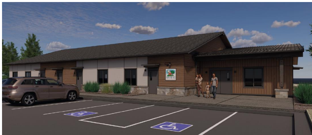
Figure 3a: Proposed Mountain Tots facility façade, south facing entrance