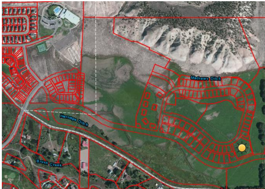
Figure 1: Site Overview

The project site is situated southeast of the Pool & Ice Rink complex and northwest of Ouzel Lane, as shown in the aerial map below. The lot is generally flat, with the areas around the property having been graded as part of the Haymeadow Filing 2 infrastructure installation. The property is bordered by planned residential development areas to the north and west, the Willow Tree Corridor to the east, and the future Trailhead Community Park to the south. Brush Creek lies farther to the southwest, outside the disturbance area.